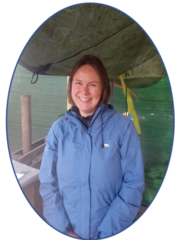
Shona Supply Practitioner