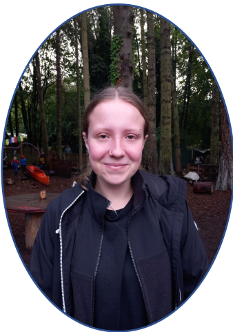
Ciara Supply Practitioner